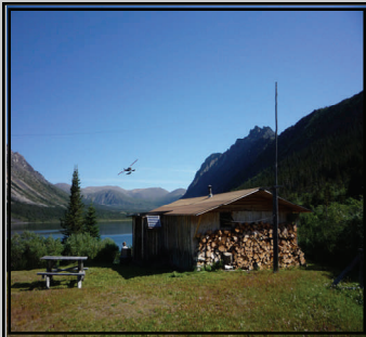
Moon Lake Camp