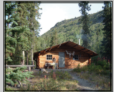
Tutshi Lake Camp

Pre-season, we cut out some old trails to pave the way for the horses who were brought into the hunting area for the first time in 20 years. The horses really helped expand the hunting opportunities and discover new hunting ground.