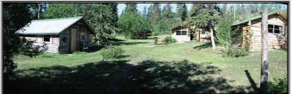
Base Camp- Comfortable Outpost in the Wilderness